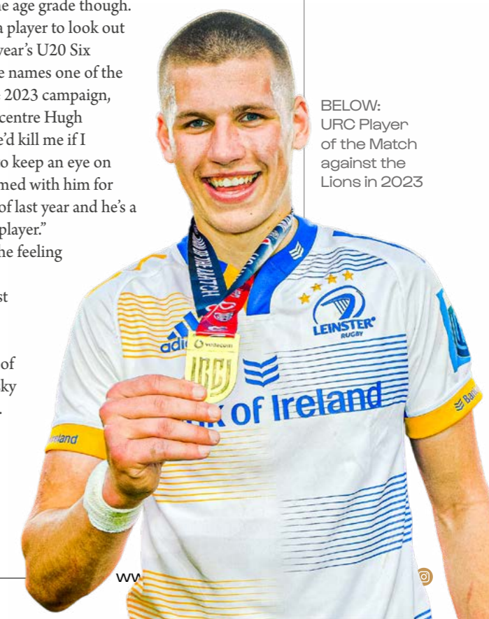
BELOW: URC Player of the Match against the Lions in 2023