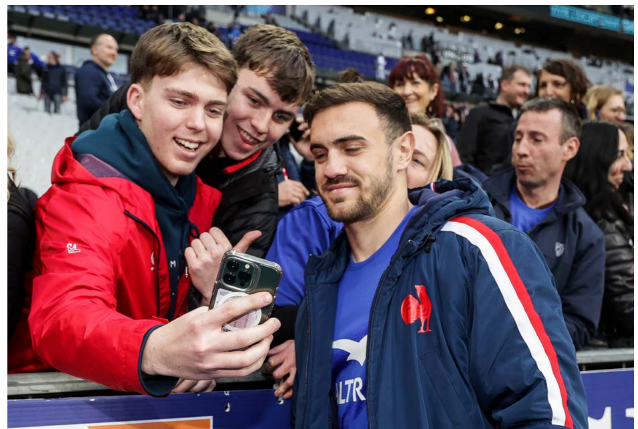
ABOVE: A fan shares his winning team with Melvyn Jaminet